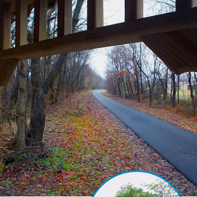
(Above) A view of the Wingo Rail Trail from a gazebo shelter.