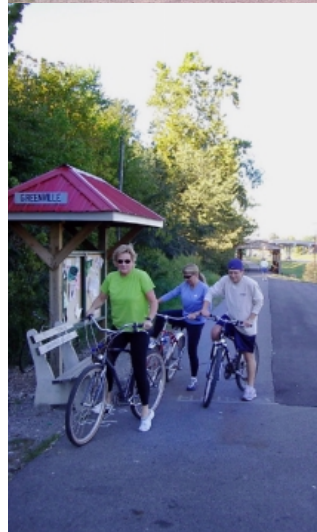
This multi-use 6 mile trail in Muhlenberg County connects Central City and Greenville. It supports the use of hikers, bikers, rollerbladers and horseback riders.