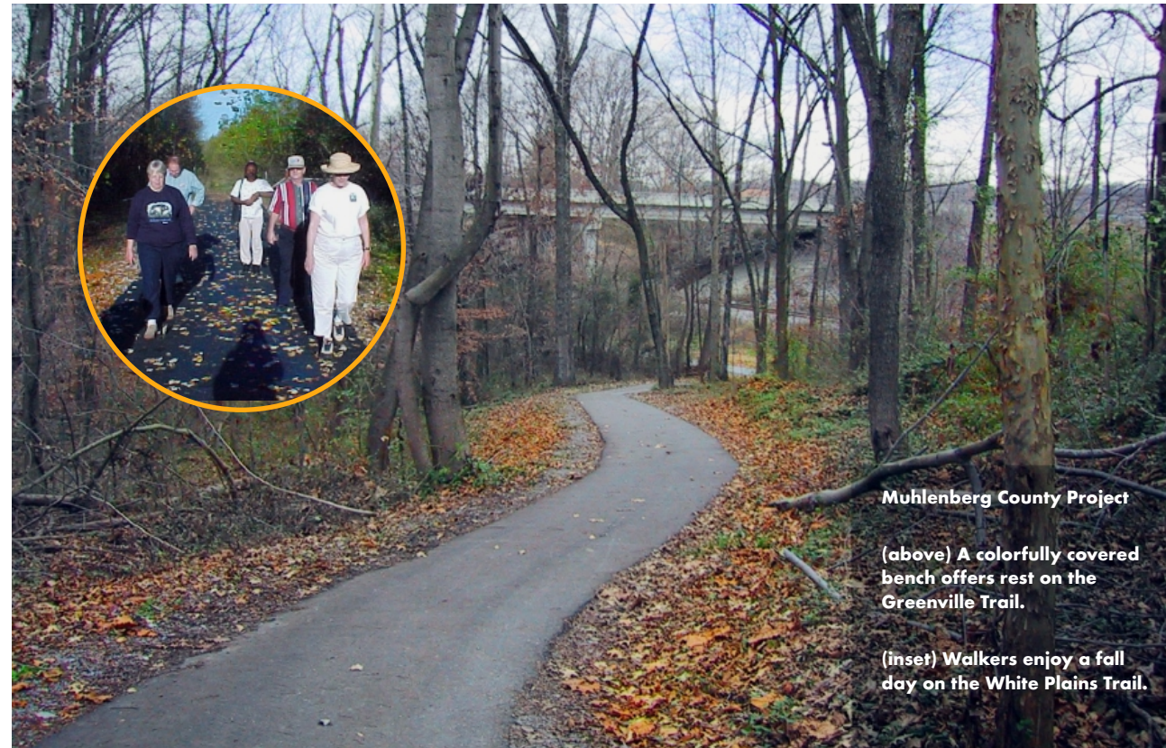
Muhlenberg County Project