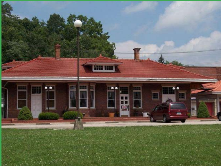
C & O Railway Depot at Olive Hill