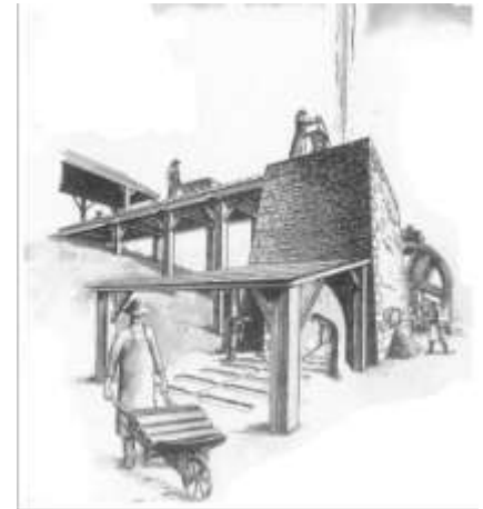
Typical workings of a charcoal iron furnace. Unlike the above rendering, the Mt. Savage cast shed was mounted near the top of the stack.